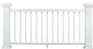
RESERVE RAIL ™ *Available regionally