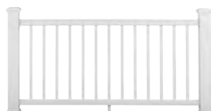
RADIANCE RAIL EXPRESS ®