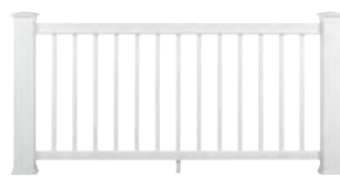
RADIANCE RAIL ®