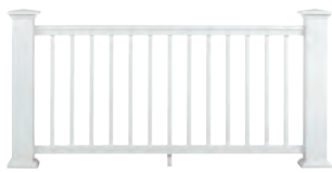
TRADEMARK RAIL ™ *Available regionally